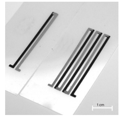
Fig. 1 Printed thermocouples

Introduction: The work reported in this Letter builds on previous work done at Brunel University on the printing of passive electronic components [1, 2], from simple capacitors and resistors, to more complex integrated filter structures, microwave circuit components and humidity sensors [3]. Printed thermocouples have been manufactured using a variety of specifically formulated thermoelectrically active inks (see Fig. 1). The printed p- and n-type structures have been thermoelectrically characterised, and their combination into a thermocouple configuration (see Fig. 2) has resulted in generated electromotive force (EMF) per degree temperature differences comparable to standard thermocouple configurations. Results also compare favourably with the thermoelectric performance of other work on novel thermocouple manufacture methods, including that reported by Wen and Chung [4], and Nogi et al. [5].